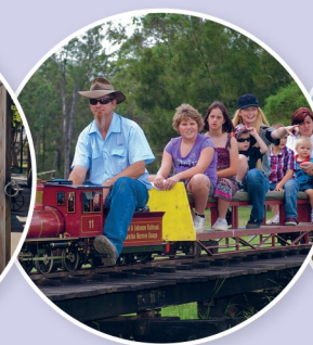
Grandchester Model Steam Railway