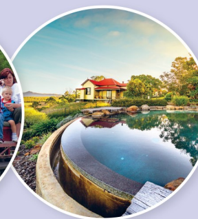
Spicers Hidden Vale