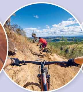
Hidden Vale Adventure Park