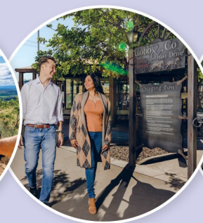
Cobb & Co Heritage Park