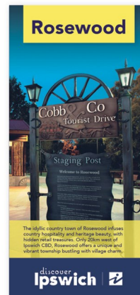
Cover image: Robelle Domain

Disclaimer: The Greater Springfield Precinct Guide is created and distributed by Ipswich City Council in conjunction with the Ipswich Tourism Operators Network. All information is correct at time of printing. Printed June 2023.